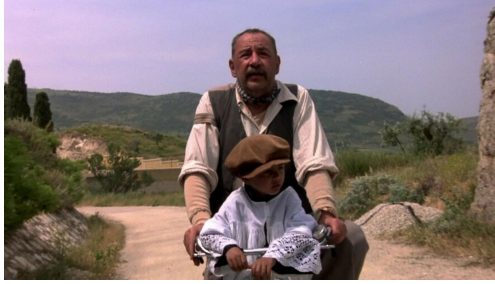
The two protagonists, in another frame of the

ENTERTAINMENT SPORTS digital technology and shopping malls is baptized Cinema Paradiso. When it was finally possible to return to the seats, after the closure due to confinement, many Spanish cinemas were clear about the best way to meet their audience again: they rescued Tornatore's film. His track record also attests to his importance: he won the Special Jury Prize at the 1989 Cannes Film Festival and the Oscar for best foreign-language feature the following year.