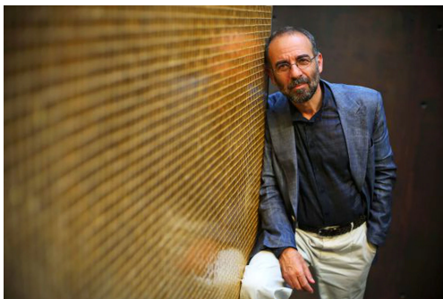
The filmmaker Giuseppe Tornatore,

The passage of time has also taken two protagonists of the film: Philippe Noiret, who played Alfredo, died in 2006 and Jacques Perrin, who played Totò as an adult, died just a few months ago. And Salvatore Totò Cascio, who at the age of eight became the most famous child in world cinema, soon discovered that his life had little to do with the fairy tale he had starred in: instead of a promising career, an illness awaited him, which has ended up condemning him to almost total blindness. He himself preferred to hide from the spotlight for decades, until recently he felt ready to tell Il Corriere della Sera about his drama and his path to overcoming it.